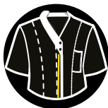
CONCEALED ZIP FASTENING