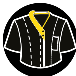
CONTRASTING TRIM TO NECK