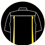
BACK ACTION PLEATS